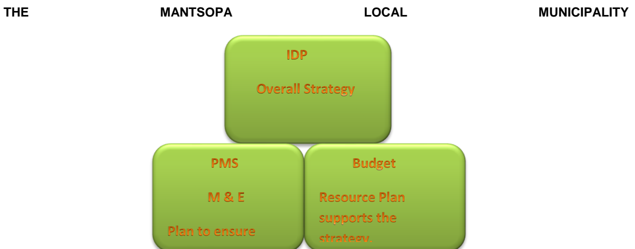
Fig 1: The linkages between IDP, Budget and PMS

The IDP, performance management systems (PMS) and budget are all components of one overall development planning and management system. The IDP sets out what the municipality aims to accomplish, how it will do this. The PMS enables the municipality to check to what extent it is achieving its aims. The budget provides the resources that the municipality will use to achieve its aims. As indicated earlier, every attempt has been made in this process plan to align the IDP and PMS formulation and/or review, and the budget preparation process. The linkages of the three processes are summarized in the following diagram: