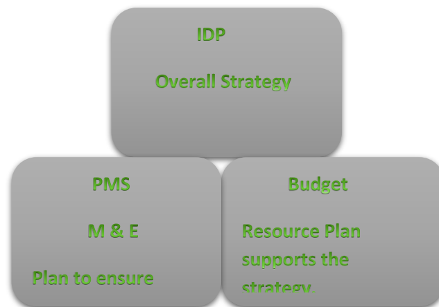
Fig 1: The linkages between IDP, Budget and PMS

achieving its aims. The budget provides the resources that the municipality will use to achieve its aims. As indicated earlier, every attempt has been made in this process plan to align the IDP and PMS formulation and/or review, and the budget preparation process. The linkages of the three processes are summarized in the following diagram: